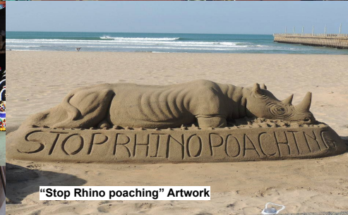
Durban's Golden Mile Beach Promenade