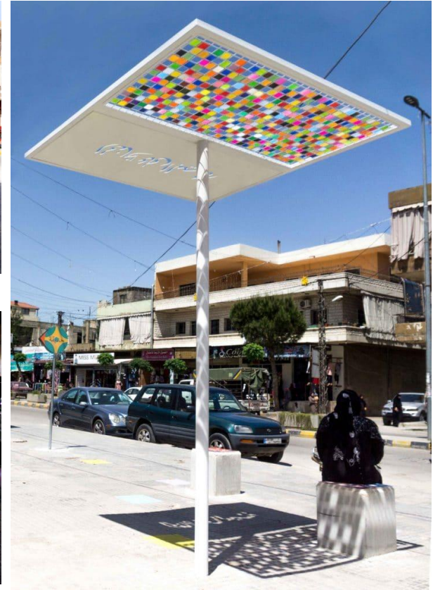
Public shading intervention in Bar Elias