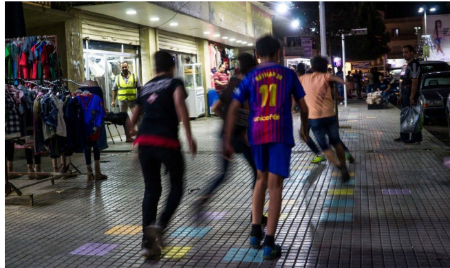
Painted Street intervention in Bar Elias