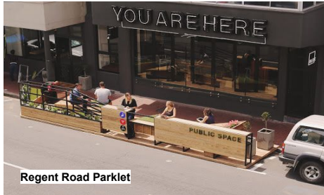
Regent Road Parklet

Future planning and design should consider providing infrastructure that allows multiple functions and change of functions in public space.