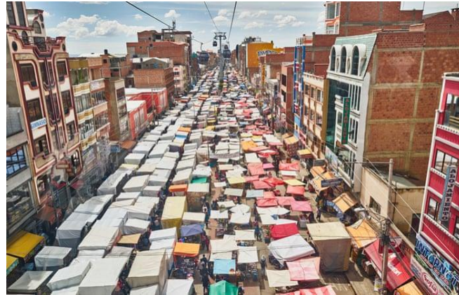
El Alto market, Bolivia