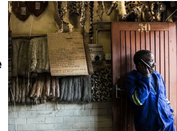
A shop at Kwa Mai Mai indigenous market

Future planning and design of public space should work with locally available materials/resources considering the economic downturn caused by covid.