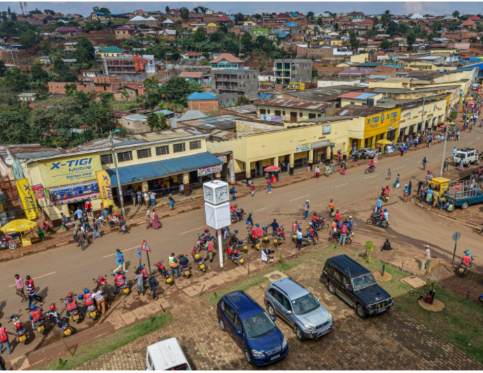
A street in Rwanda