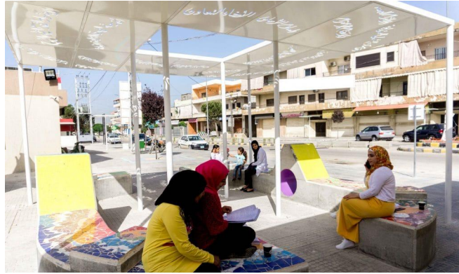
Public seating intervention in Bar Elias

Participatory Spatial Intervention: Addressing vulnerabilities through infrastructure