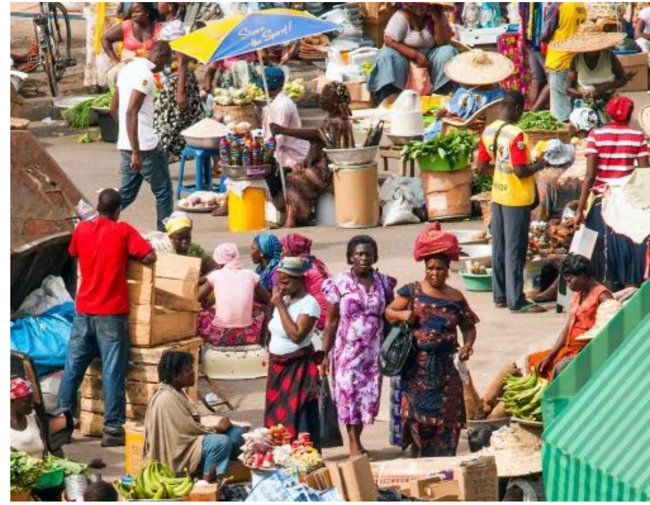
Makola market, Accra