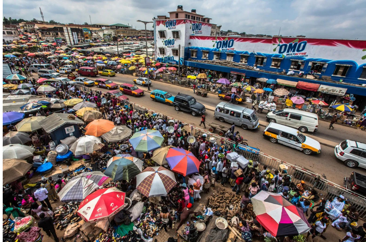
Kejetia market, Kumasi