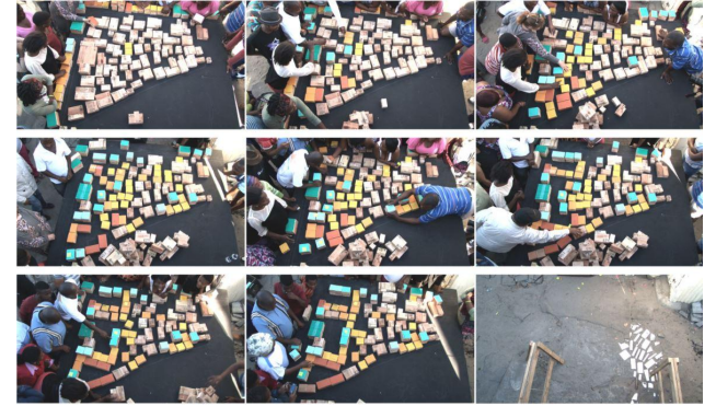
Empower Shack, Khayelitsha