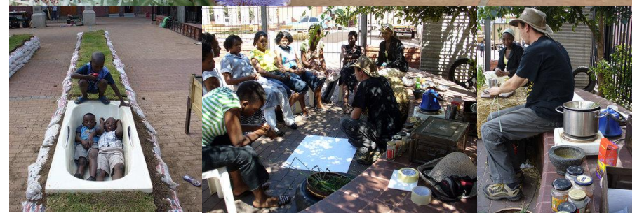
2007 - Cascoland, The Drill Hall, Johannesburg,