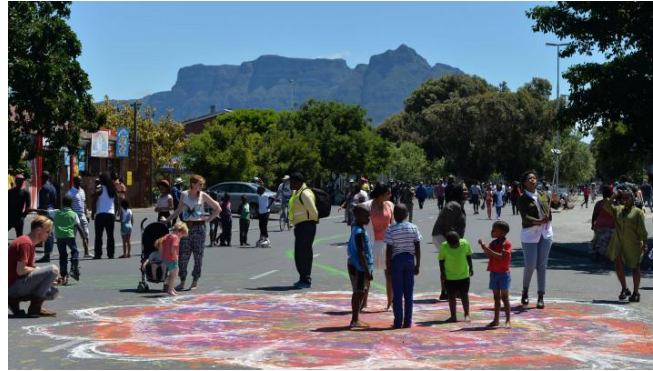
Open streets Langa