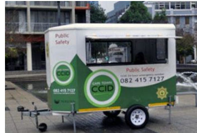
CCID Public Safety Kiosk

Future planning and design should consider providing infrastructure that will enhance surveillance in desolated public spaces to ensure that users feel safe at all times.