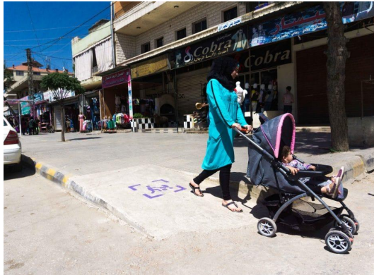
Ramps in Bar Elias street intervention