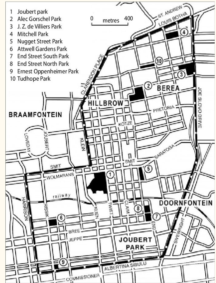
Illustration by Leani De Vries

E.g. The regeneration of Public Spaces in Braamfontein to promote safety and encourage people to use those spaces